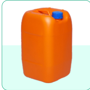
20LTR POLYCAN (MOUSER)

CAPACITY: 10-14 Ltrs COLOUR: As Per Requirement WEIGHT: 650 to 850 Gms MOUTH OD: 58 mm