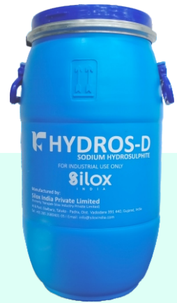
40 Ltr DRUM WITH METAL CLAMP & LID

CAPACITY: 30-35 Ltr COLOUR: As Per Requirement WEIGHT: 1.8 to 2.5 Kgs MOUTH OD: 10 Inch