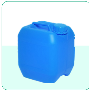
7.5LTR POLYCAN (MOUSER)

CAPACITY: 5 Ltrs COLOUR: As Per Requirement WEIGHT: 300 to 500 Gms MOUTH OD: 45 mm