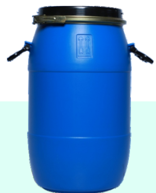
60-65Ltr DRUM WITH METAL CLAMP & LID

CAPACITY: 50-55 Ltr COLOUR: As Per Requirement WEIGHT: 2.5 to 3.2 Kgs MOUTH OD: 14 Inch