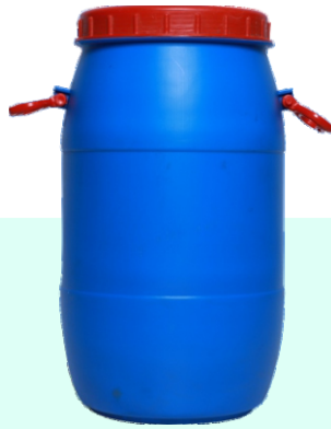
30-35Ltr DRUM WITH THREADED LID

CAPACITY: 30-35 Ltr COLOUR: As Per Requirement WEIGHT: 1.8 to 2.5 Kgs MOUTH OD: 10 Inch