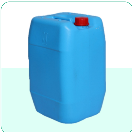
35LTR POLYCAN (MOUSER)

CAPACITY: 30 Ltr COLOUR: As Per Requirement WEIGHT: 1.5 to 2.0 Kgs MOUTH OD: 58 mm