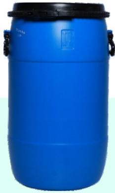
30-35Ltr DRUM WITH PLASTIC CLAMP & LID

We are engaged in providing a large range of Plastic Full Open Top Jar/Drum. For storing of semi liquid /powder packaging for domestic, commercial and many other purposes, this product is widely used. Besides these, our Plastic Full Open Top Drum is quality tested and provided as per the specifications of clients. our FOT available with plastic as well as metal clamp.