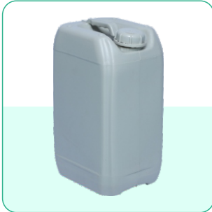
10/14 LTR POLYCAN (MOUSER)

CAPACITY: 7.5/10 Ltr COLOUR: As Per Requirement WEIGHT: 650 to 850 Gms MOUTH OD: 58 mm