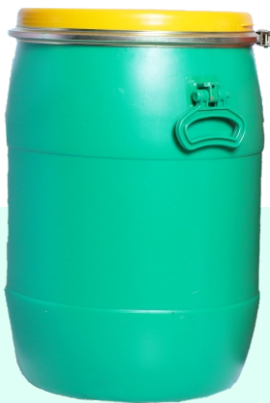
45-50Ltr DRUM WITH METAL CLAMP & LID

CAPACITY: 40 Ltrs COLOUR: As Per Requirement WEIGHT: 2.0 to 2.5 Kgs MOUTH OD: 10 Inch