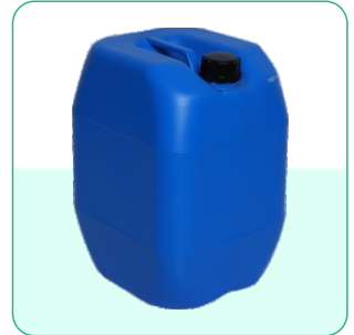
30LTR POLYCAN (MOUSER)

CAPACITY: 20 Ltr COLOUR: As Per Requirement WEIGHT: 1 to 1.5 Kgs MOUTH OD: 58 mm