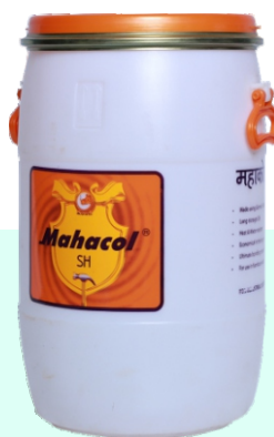
50-55Ltr DRUM WITH METAL CLAMP & LID

CAPACITY: 45-50 Ltr COLOUR: As Per Requirement WEIGHT: 2.5 to 3.2 Kgs MOUTH OD: 14 Inch