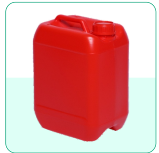
10LTR POLYCAN (MOUSER)

CAPACITY: 7.5Ltrs COLOUR: As Per Requirement WEIGHT: 600 to 750 Gms MOUTH OD: 58 mm