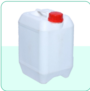
5LTR POLYCAN (MOUSER)

Narrow Mouth Polycans being the strongest, safest & most cost effective packaging products are packed with numerous technical & operational advantages over conventional jerry cans. Specially designed to take the rigours of hostile handling conditions, these Polycans are most suited both for domestic and export packaging. These are available in various exclusive designs and sizes ranging from 5 to 35 liters. Narrow Mouth Polycans can be availed with tamper evident & child resistant closures. Narrow Mouth Polycans made out of special grade High Molecular - High Density Polyethylene and are well tested as per IIP standards. Our Narrow Mouth Polycans are normally provided with one opening but can be designed as two openings.