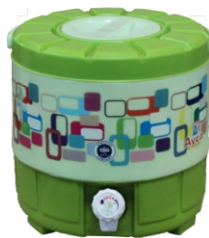
WATER JUG 8 LTR.