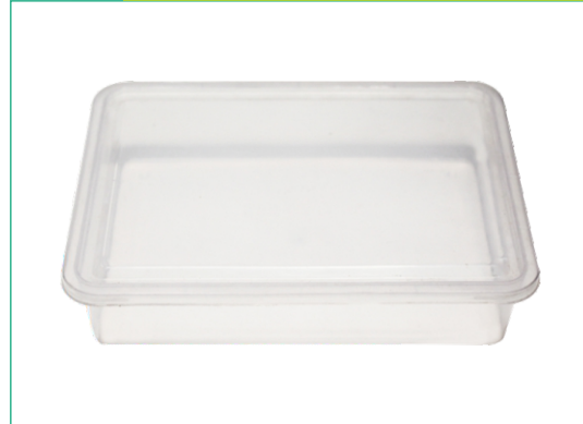
SWEET BOX 1000GM