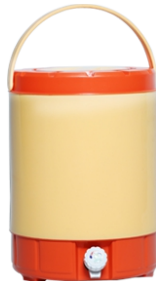
WATER JUG 15 LTR.