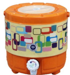
WATER JUG 6 LTR.