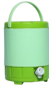
WATER JUG 12 LTR.