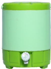
WATER JUG 10 LTR.