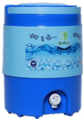
WATER JUG 18 LTR.