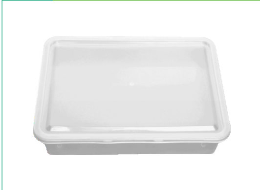
SWEET BOX 500GM

Quality Food Containers for Cafeteria, Family or Group Events. Packaged in a Beautiful Box to Protect From Shipping/Handling Breakages and Contaminants. suiting every type of appetite and activity. Easy to clean and dishwasher safe.