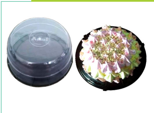
1.5 LTR CAKE MAGIC BOX

Color: As per Requirement Weight: 130Gms